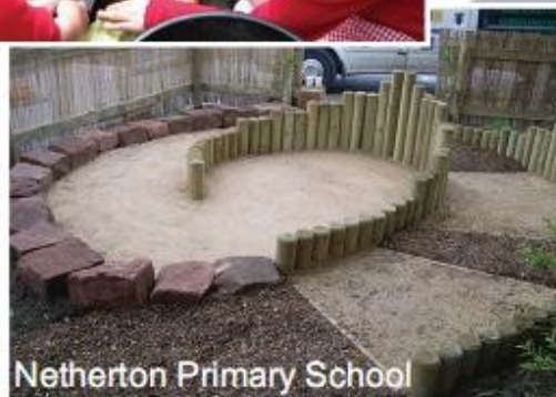
Netherton Primary School