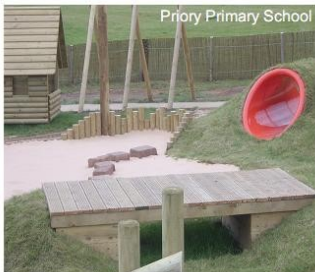
Priory Primary School