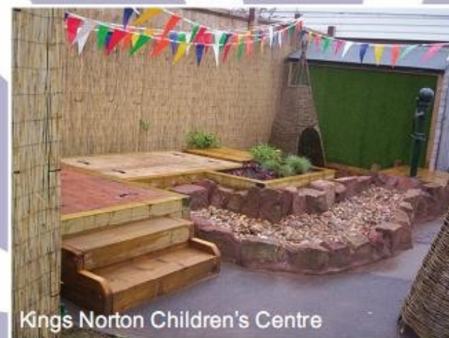
Kings Norton Children's Centre